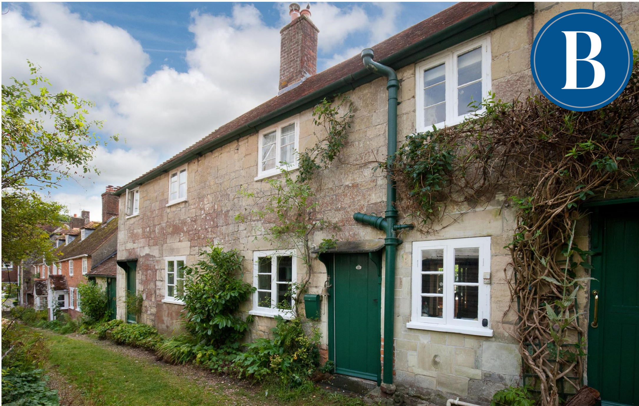
Says Cottages, Hindon